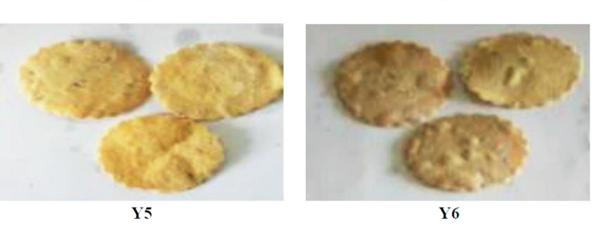
Figure 2 Snacks processed from drought-tolerant corn genotypes. NSC178 = Single Cross Giza 178 planted under normal conditions, DSC178 = Single Cross Giza 178 planted under drought conditions, Y1-Y6 = new yellow corn hybrids planted under drought conditions